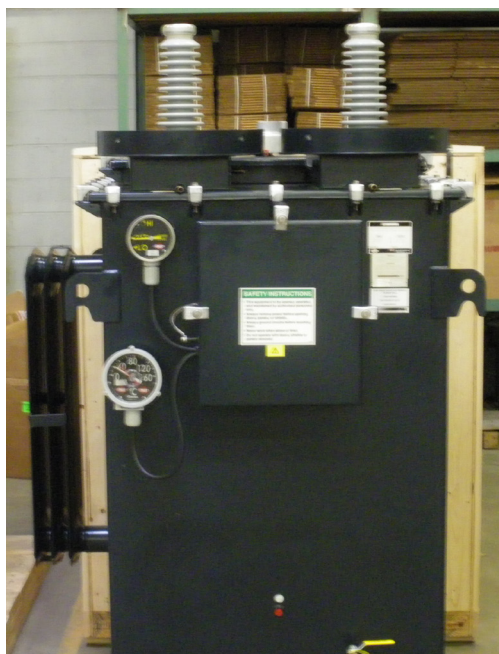
Pictured above is a fully refurbished double-half wave T/R set that has been tested and is ready for shipment to a utility customer in the Midwestern U.S..