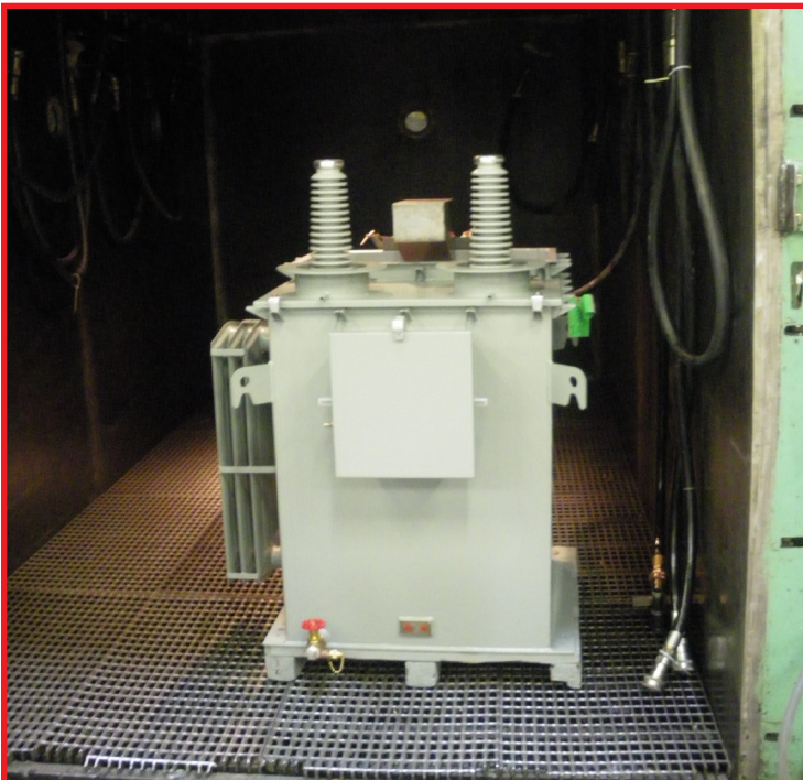
NWL has two oil processing chambers that allow the high voltage tanks to be filled under a strong vacuum, ensuring the windings are totally impregnated. .