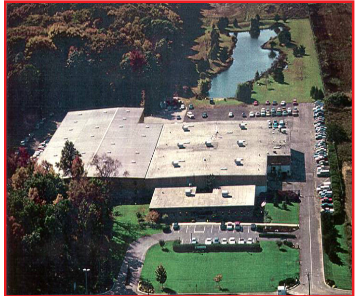
NWL has over 150,000 ft 2 of manufacturing and repair space at our two facilities in Central NJ. The main factory in Bordentown NJ is pictured above. The second plant is dedicated to metal fabrication and high voltage tank repair.